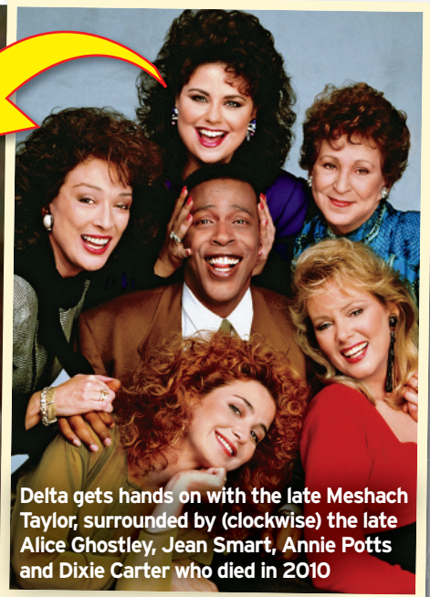
Delta gets hands on with the late Meshach Taylor, surrounded by (clockwise) the late Alice Ghostley, Jean Smart, Annie Potts and Dixie Carter who died in 2010

Ironically, Delta was a slender Miss Florida at age 18 and competed